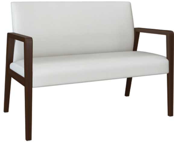
Model: VLDFIXB46G 46W 27.5D 35H 42SW 19SD 19SH 26AH

In any healthcare setting where two would like to sit comfortably together, the Valdina Bariatric – 46W Short Back is a beautiful solution. The single back and seat cushion are just wide enough for a parent and small child. Built for maximum stability and strength, utilizing our steel reinforced joint system, this thoughtfully designed chair is available in two back heights. The chair back extends to the seat rail and the cleanout is incorporated behind the seat cushion providing a clean, functional look.